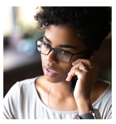
Some employees will likely wish to speak about job-related worries.

A mental health audit or staff survey is a good place to start in order to get a clear picture of the mental health of your staff prior to returning to work, as well as how well you are currently supporting them and what further improvements could be made. This may sound complicated to set up, but you could adapt tools that are already in use, such as surveys, review meetings, or HR data. Putting relevant questions into these existing tools will help to build a comprehensive picture, without creating extra work. Regular one-to-one meetings and catch ups are also a great place to ask staff how they are getting on. Furthermore, doing this regularly will help to build trust and give staff a chance to raise problems at an early stage. Line managers who know their staff and regularly hold catch ups or supervision meetings to monitor work and wellbeing, are well placed to spot any signs of stress or poor mental health at an early stage. You may want to ask your team members how one-to-one meetings can be tailored to suit their needs and encourage staff to request meetings outside the normal schedule if they need to discuss anything important.