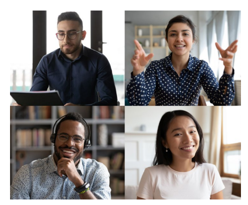
Encourage staff to find time for virtual coffee breaks, lunch breaks, or even happy hours with colleagues.