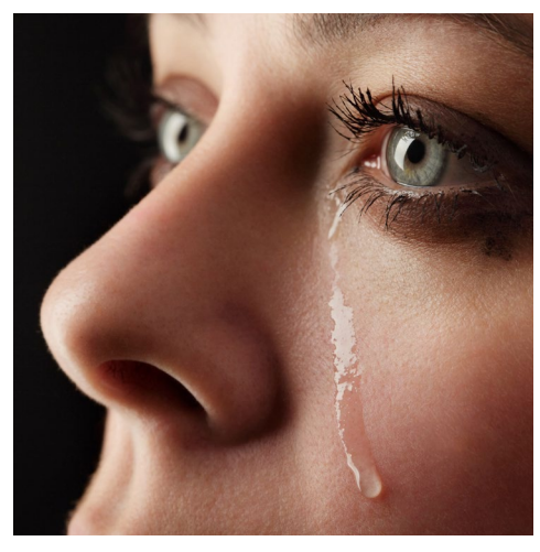
Staff may have lost family members, partners or friends.