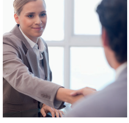
First Psychology Assistance offers:

Employee counselling, CBT & psychological therapies; promoting wellbeing in the workplace; and rehabilitation and personal injury support.