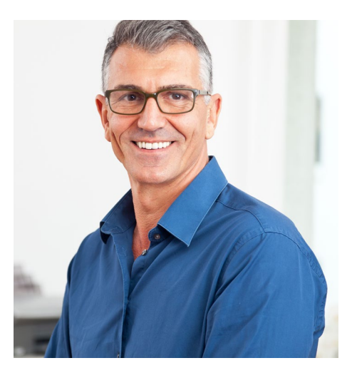
Information sharing is often seen as an indicator of trust, so managers who are more open are also more likely to be seen as more credible and trustworthy.