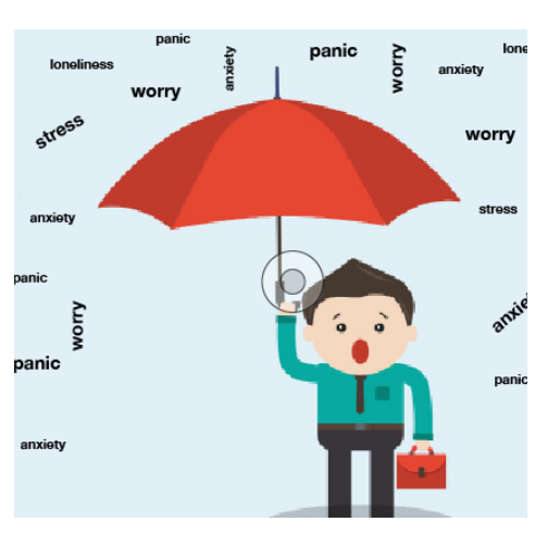
Some people will experience lasting fear of infection.

Accordingly, managers may be faced with staff who are fearful to return to work due to the health risks this poses to themselves and those closest to them, particularly if they are caring for an elderly or vulnerable relative. They may also be faced with staff who feel too afraid or unable to return to work if they normally rely on public transport to commute, as the use of this is still being discouraged due to high risks of infection.